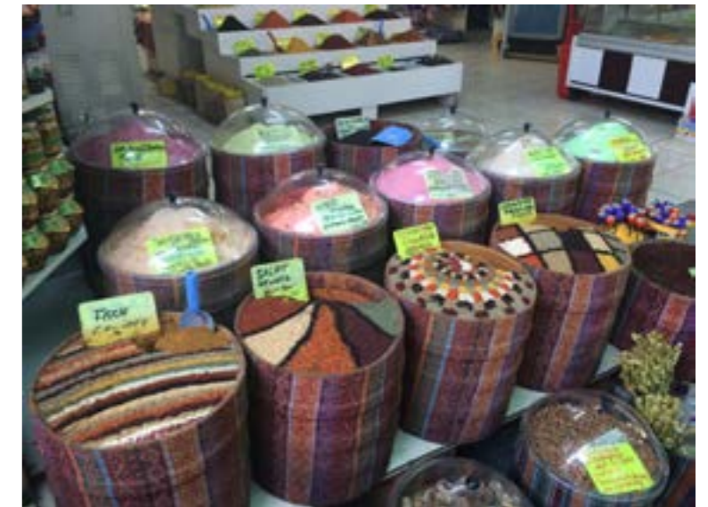
Markets in Antalya