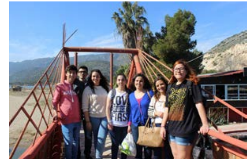
Happy portuguese students