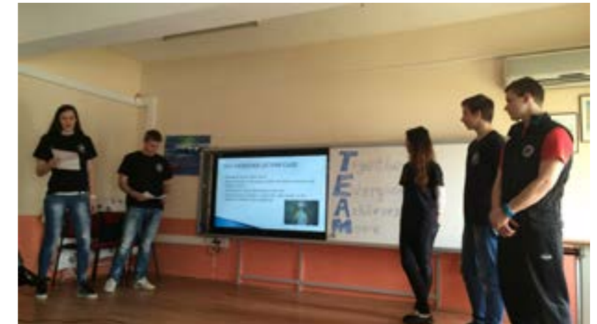
Proud students with their certificates