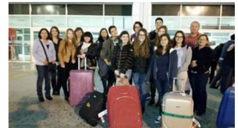
Italian group on the way back home