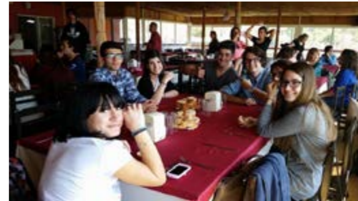
Italian group during lunch