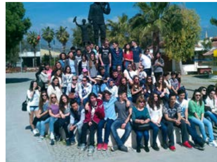
ERASMUS+ group during visiting areas of Perge - Aspendos - Side