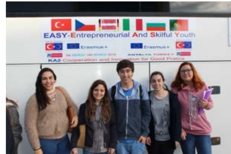
Portuguese team in front of EASY bus