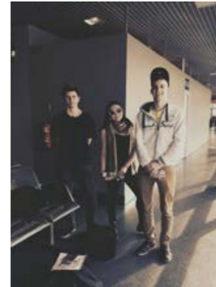
Latvian students on the way to Antalya