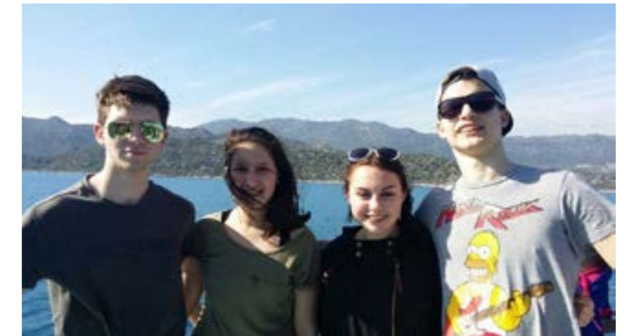
Latvian and Turkish students