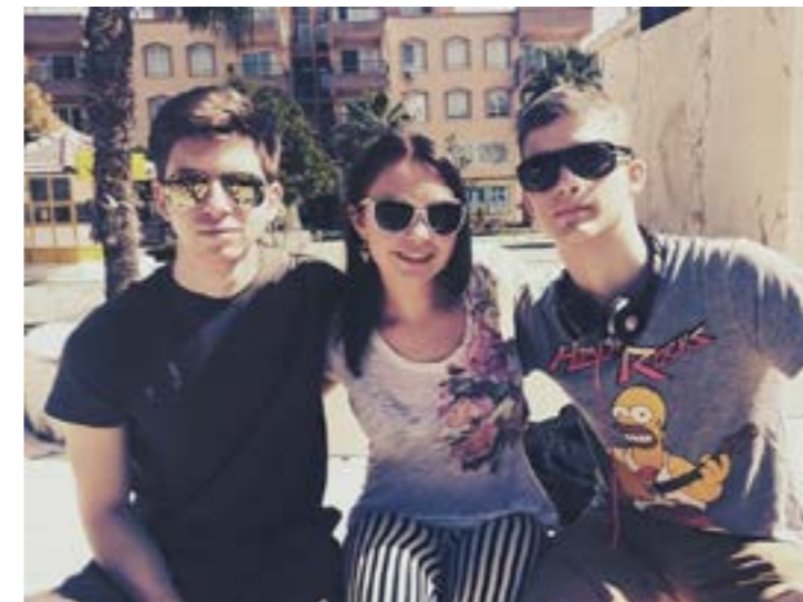
Big bosses with sunglasses :-)