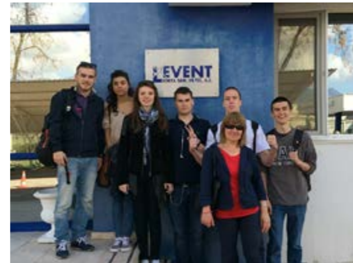
Bulgarian students during visiting a company - Levent Chemical Industry