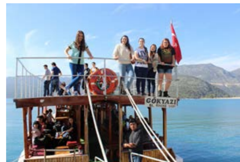
Portuguese pirates :-)